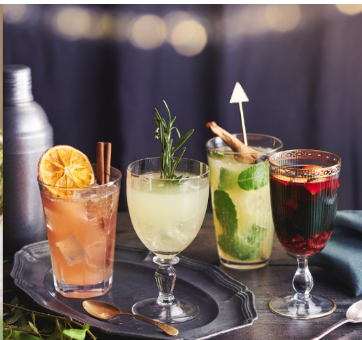
LOWER ALCOHOL &amp; ZERO PROOFS