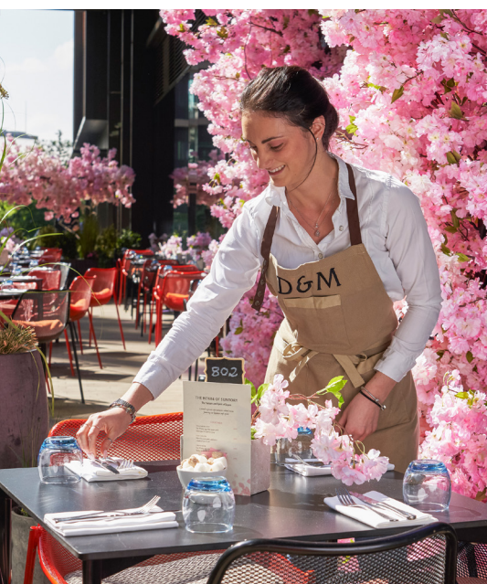
DRAKE & MORGAN AT KING'S CROSS

From October, we're partnering with some surprise magical brands to whisk you far away to even dreamier lands. Join us to find out why outside is the new inside this season... whatever the weather.