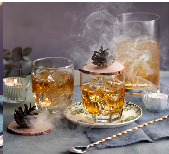
PINE OLD FASHIONED