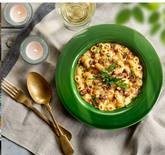
MAC &amp; CHEESE