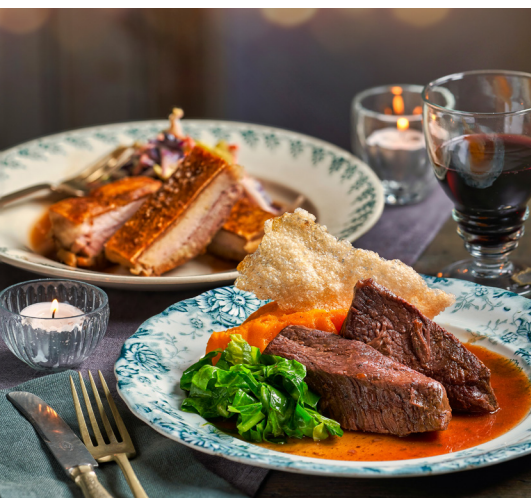
JACOB'S LADDER OF BEEF

PLENTY of plant power to go round. Of course, the fey folk are famous for having a serious sweet tooth so fear not, there's a range of perfect puds from Sticky Toffee to a Chocolate & Cherry Sundae - what is this wonderful witchcraft? - to choose from.