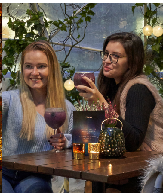
THE SIPPING ROOM