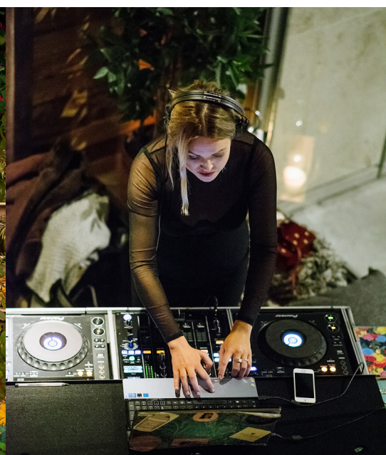
PARTIES &amp; CELEBRATIONS