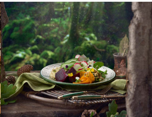
Winter Rainbow Bowl