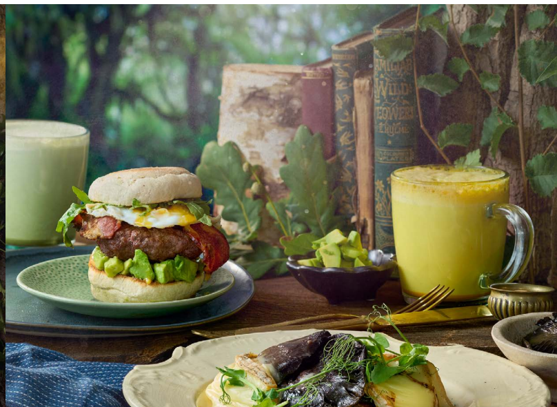
Wellness Latte & the Breakfast Burger