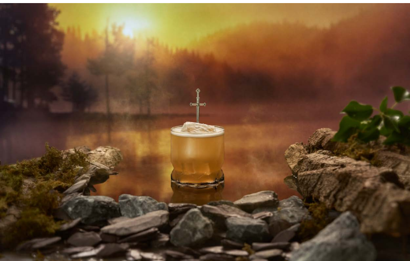
Sword in the Stone

folk stories go down better when enjoyed together- kind of like a Winter Elixir or Pornstar Martini Royale sharing tree! Now that's our kind of forest. So gather up your fae-vourite folk & fly down to your nearest D&M for a drinks menu so magical, you won't be able to pixie just one.