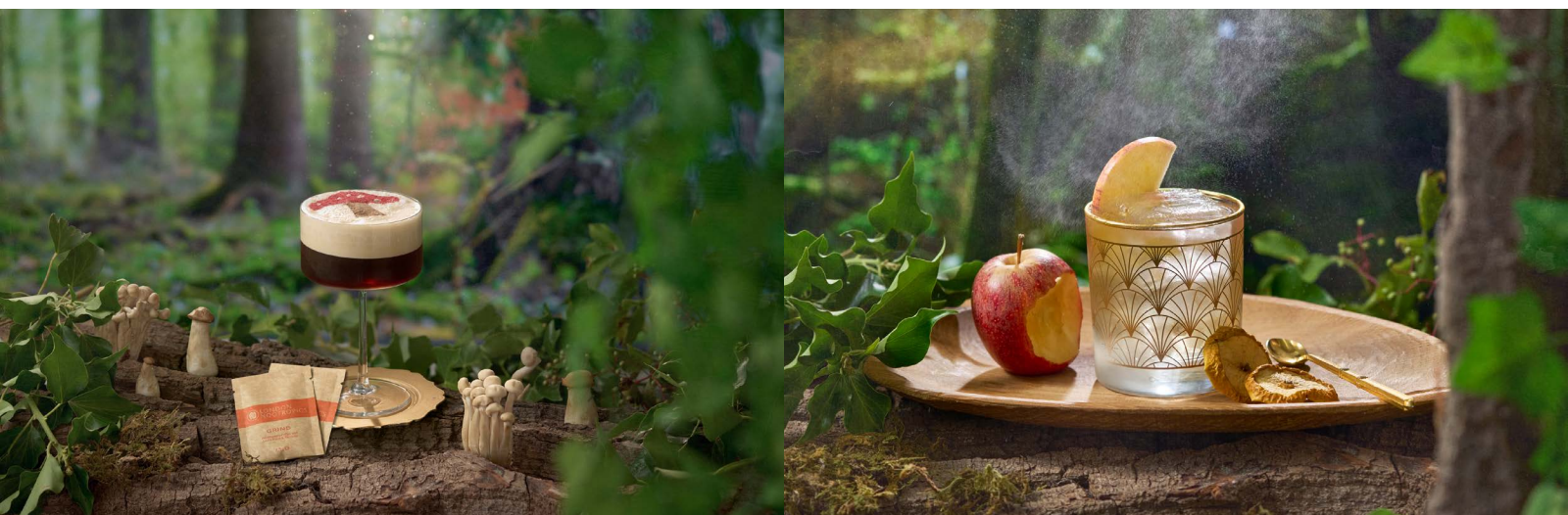
Mushroom Espresso Martini