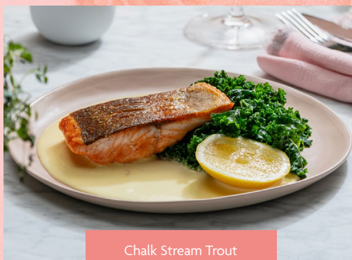
Chalk Stream Trout