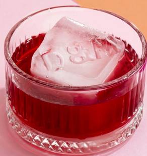
Strawberry & Vanilla Negroni

Take a sip of something fresh & watch the flowers bloom over a selection of botanical pours.