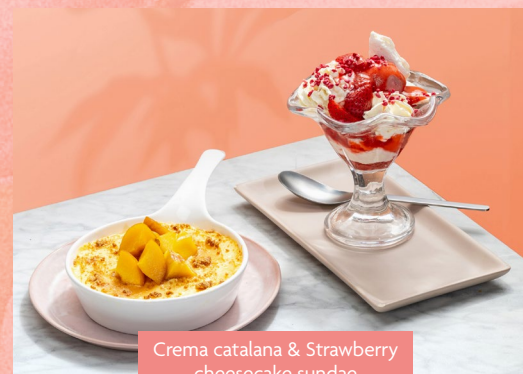
Crema catalana & Strawberry cheesecake sundae